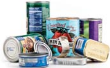
Empty Food & Beverage Cans