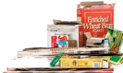
Cardboard & Paperboard