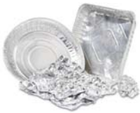
Clean Aluminum Foil, Pie Plates and Cookware