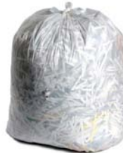
Shredded paper ONLY in clear and sealed bags – No unbagged shredded paper or dark bags. No other plastic bags please!